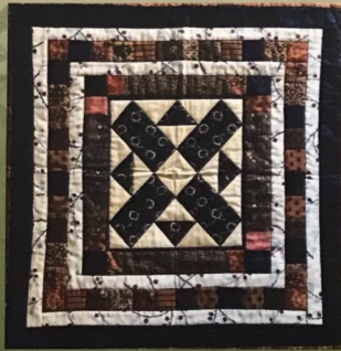
Florida Quilt Study Group: Antique Quilt Block Challenge