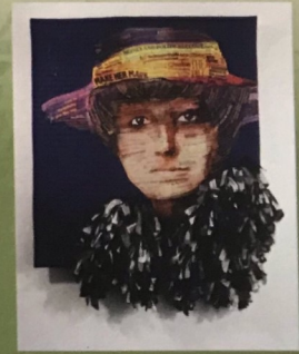
Deeds Not Words: Celebrating 100 Years Of Women's Suffrage