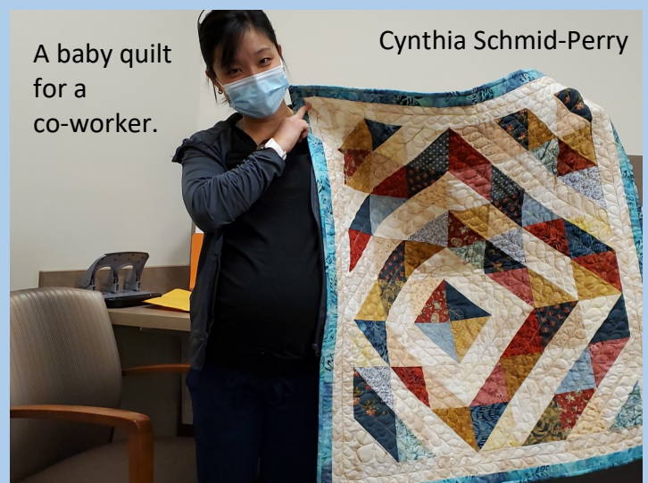
A baby quilt for a co-worker.